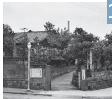
The Tokyo National School of Dentistry, the predecessor of TMDU, was established at Hitotsubashi.