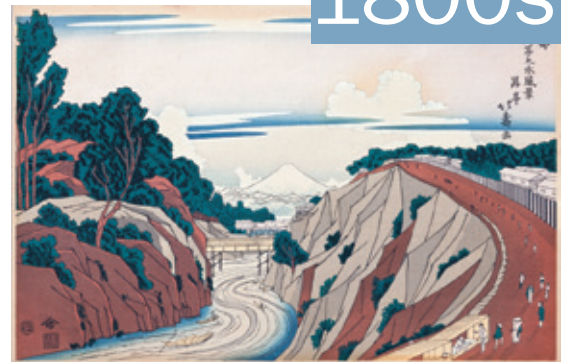
View of the Eastern Capital, Edo-Ochanomizu (woodblock by Shotei Hokuju)