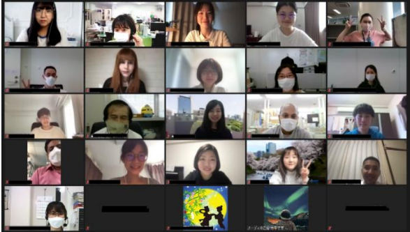
Online Tanabata event group photo