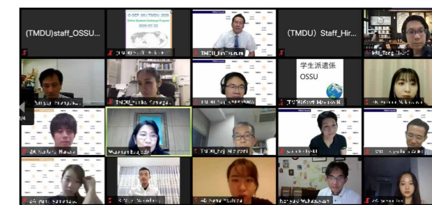
Online Students' Exchange Program (O-SEP) with Mahidol University (MU) in Thailand

The great participation of students and their positive feedback convinced us that the events were meaningful and engaging for all participants despite the new online format.