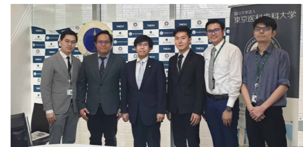
In commemoration of the admission in April 2020 (three students from the right side)

This program, which has just started, regularly holds video conferences by faculty members from both universities and the program is proceeding smoothly in collaboration with both universities.