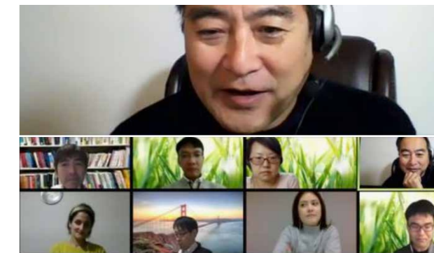
Online class conducted by a professor from Harvard University.

TMDU has been offering the Master of Public Health in Global Health (MPH) Course since 2018. The MPH Course is designed to educate individuals from around the world who want to be leaders in their fields; generating, translating, and disseminating public health-related scientific evidence in the real world to make the world a healthier place. All lectures are taught in English to train students with research competence for global health issues. We invite world-leading experts from Harvard University and Johns Hopkins University, the most prestigious and historic universities in the field of public health, to acquire world-standard research skills. In 2020, because of COVID-19, it was a great challenge for us to conduct classes with minimal disadvantages to students. We conducted classes in three new styles: online, on-demand and on-campus.