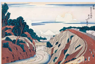
View of the Eastern Capital, Edo-Ochanomizu (woodblock by Shotei Hokuju)

This landscape shows a view of Ochanomizu, where TMDU is located today. The buildings on the right-hand side, Yushima Seido and Shoheizaka School, were the center of scholarship since the 17th century during the Edo Period in Japan. Mt. Fuji can be seen in the far distance.