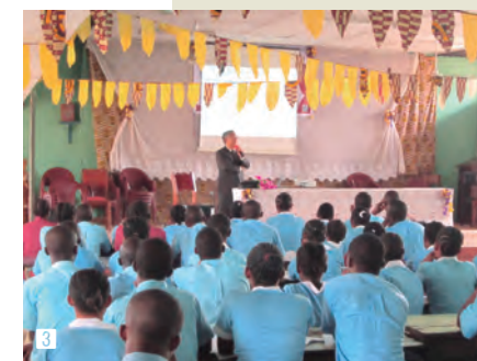
① TMDU students at "Week-end party" at the University of Ghana.