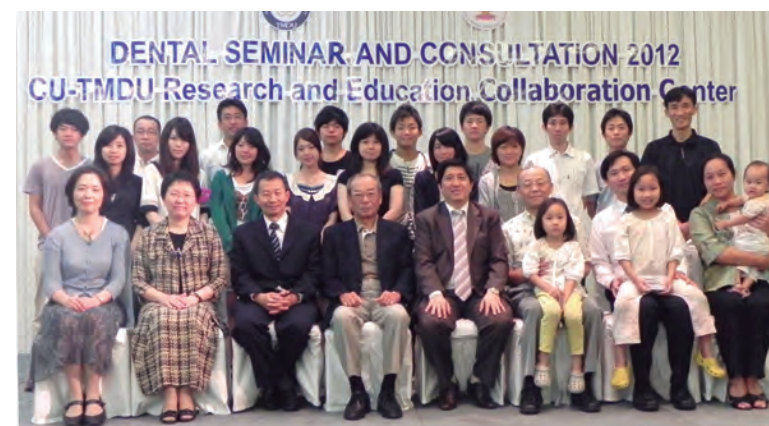
TMDU and JDAT participants at the Dental Seminar and Consultation 2012.