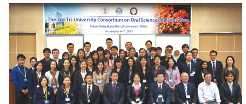
Opening session of the 3rd Tri-University Consortium on Oral Science and Education.

We have had annual meetings from 2011 to realize our mission. The 1st and 2nd consortiums