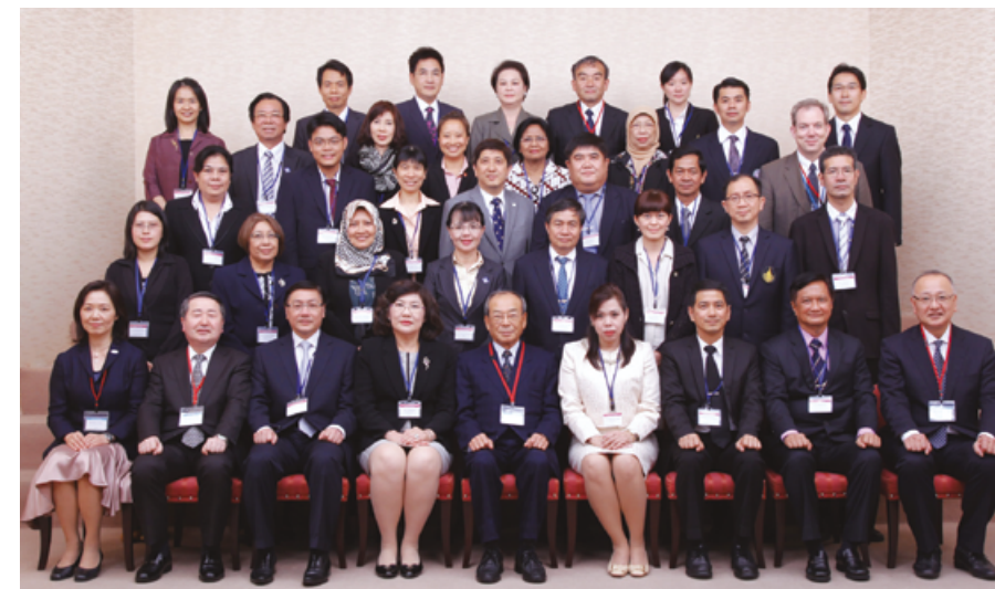
President Ohyama and participants of the Development of Dental Education in Asia 2013 -Symposium and Exchange-

After the symposium, the participants moved to Tsukuba City to visit the Tsukuba Research