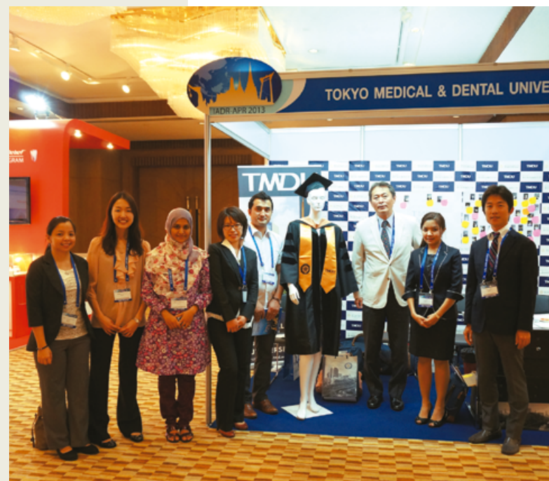
TMDU exhibition booth at IADR-APR.