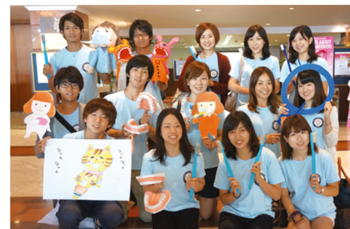
TMDU students prepared oral health education materials for pre-school children.