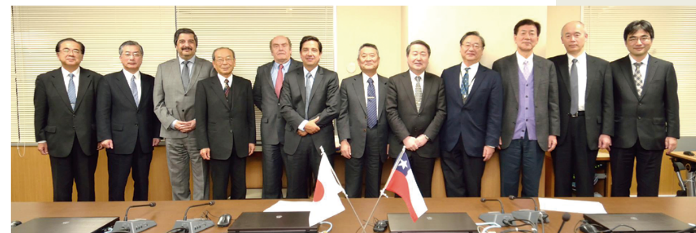
5 Meeting for joint degree courses between TMDU and the University of Chile.