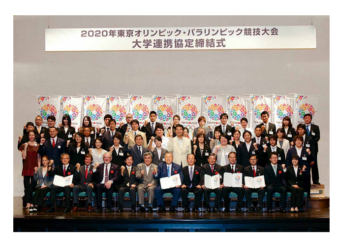
The signing ceremony and commemorative symposium held for the 2020 Tokyo Olympics and Paralympics University Partnership Agreement. TMDU along with 552 universities and junior colleges nationwide, signed the agreement.

as well as to enable patients to return to competition at a higher level of performance. The Center has departments devoted to sports medicine and dentistry and Japan's biggest hyperbaric oxygen therapy facility representing the strengths of TMDU.