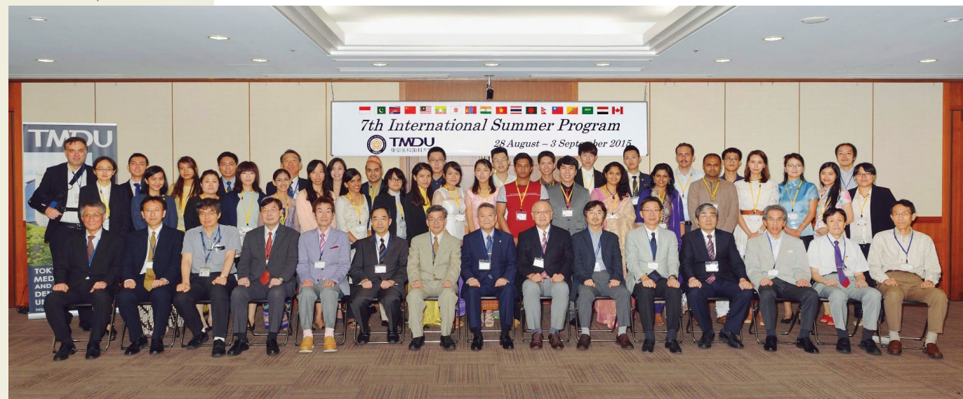
ISP2015 participants at the Welcome Party