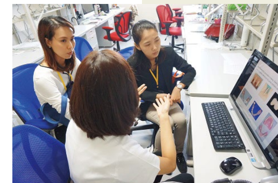
ISP Participants at the ISP2015 Lab Visit (Dentistry)

General information about the ISP can be found at: