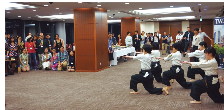
TMDU students performing Japanese martial arts at the Farewell Party