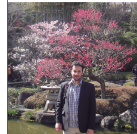
Amid the blossoms at Kamakura, April 2014

priority will be to help strengthen the health system and community-based prevention and control of communicable and non-communicable diseases. I will be seeking to upgrade my field experience and share it with coworkers in international public health. I hope my academic training plus the professional skills I am acquiring at TMDU will enable me to contribute to a well-functioning public health system in Afghanistan and ultimately to the improvement of human health around the world.