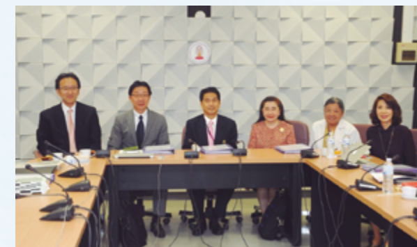
Joint meeting between CU and TMDU in Bangkok

They will start their research activities at TMDU toward the end of the first year, and will submit the research results for publication to international journals as part of the program. Finally, in order to enhance their expertise in orthodontics the students will have the opportunity to treat orthodontic patients at the CU clinic for at least 2.5 years. Their treatment methods and results will be evaluated as part of their clinical training.