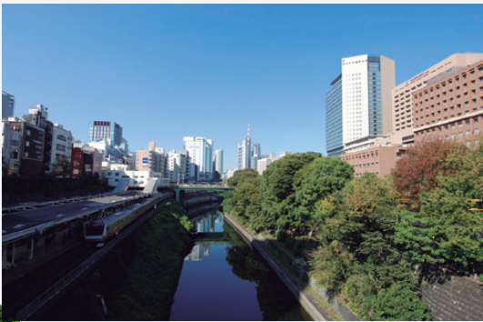
Present-day Ochanomizu, showing the same view as in the above woodblock. Ochanomizu Station is at the left and the TMDU Main Campus is at the right, with the Kanda River flowing between them.