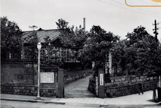
The Tokyo National School of Dentistry, the predecessor of TMDU, was established at Hitotsubashi.