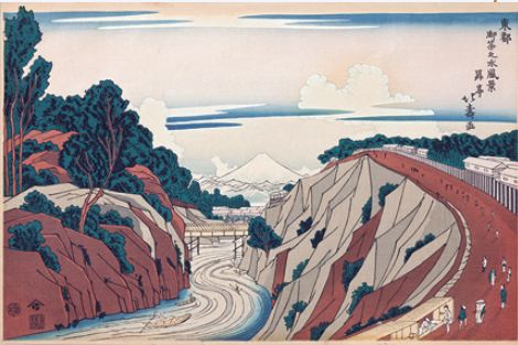
View of the Eastern Capital, Edo-Ochanomizu (woodblock by Shotei Hokuju)