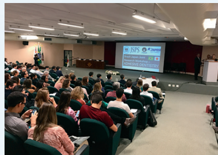
Total 304 researchers and clinicians participated the Brazil-Japan Joint Symposium on Adhesive Dentistry 2017