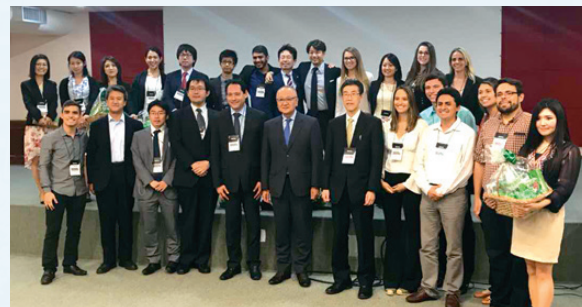
Japanese and Brazilian presenters of the Brazil-Japan Joint Symposium on Adhesive Dentistry 2017