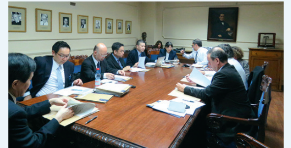
Joint meeting at UCh, Santiago