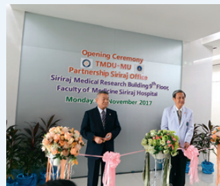
The opening ceremony for the new office (at Siriraj Hospital)