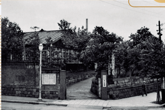
The Tokyo National School of Dentistry, the predecessor of TMDU, was established at Hitotsubashi.