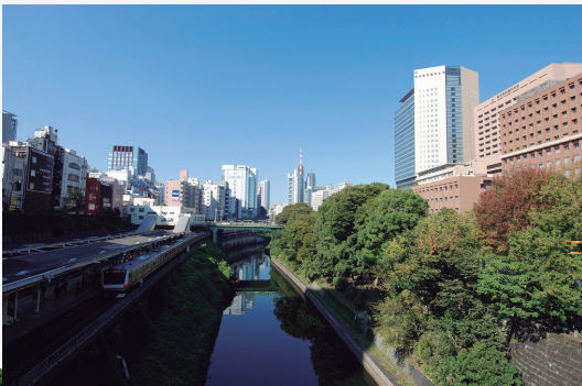
Present-day Ochanomizu, showing the same view as in the above woodblock. Ochanomizu Station is at the left and the TMDU Main Campus is at the right, with the Kanda River flowing between them.