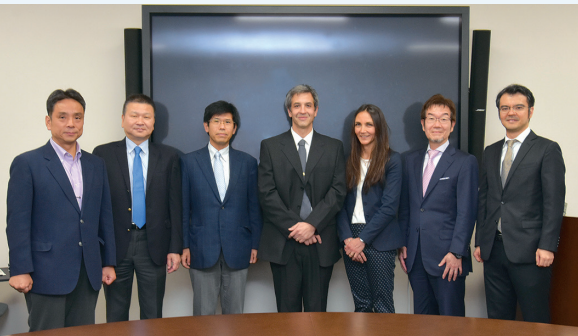
Meeting between TMDU and UCh professors

from TMDU and UCh meet frequently to have face-to-face meetings on improving the program, in addition to monthly teleconferences. In September, TMDU and UCh professors gathered at the Joint Degree Program Workshop 2018 at TMDU. Experts from both universities gave wonderful presentations on each field, followed by meaningful discussions with the participants.