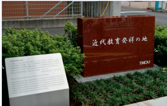
This monument at TMDU's Ochanomizu Gate commemorates the Birthplace of Modern Education. It honors Japan's modern education system, which was developed in this neighborhood after the Meiji Restoration, and marks TMDU's emergence at this site in 1930 as the world's first comprehensive medical-dental graduate school.