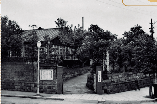
The Tokyo National School of Dentistry, the predecessor of TMDU, was established at Hitotsubashi.