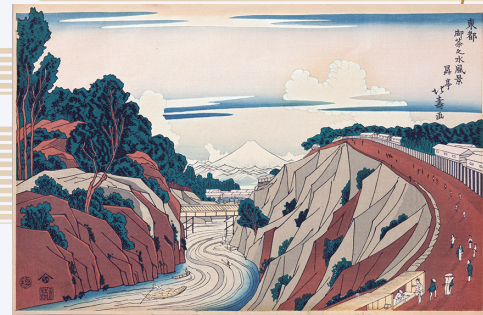
View of the Eastern Capital, Edo-Ochanomizu (woodblock by Shotei Hokuju)