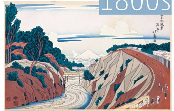
View of the Eastern Capital, Edo-Ochanomizu (woodblock by Shotei Hokuju)

This landscape shows a view of Ochanomizu, where TMDU is located today. The buildings on the right-hand side, Yushima Seido and Shoheizaka School, were the center of scholarship since the 17th century, the Edo Period in Japan. Mt. Fuji can be seen in the far distance.