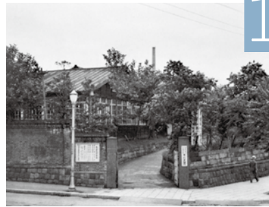
The Tokyo National School of Dentistry, the predecessor of TMDU, was established at Hitotsubashi.

Today, TMDU is still located in Ochanomizu / Yushima district where its predecessor, the Tokyo National School of Dentistry, had moved in 1930, two years after its founding. TMDU has become known as one of the most excellent research universities in Japan.