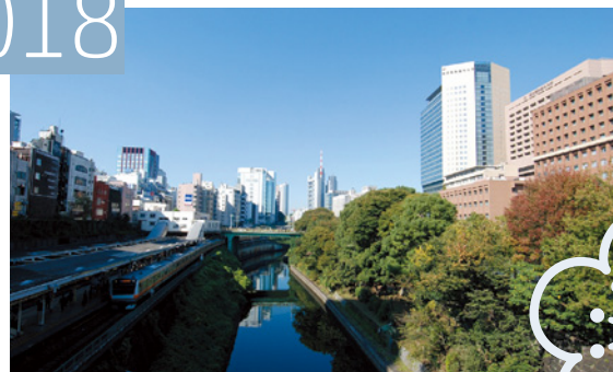
Present-day Ochanomizu, showing the same view as in the above woodblock. Ochanomizu Station is at the left and the TMDU Main Campus is at the right, with the Kanda River flowing between them.