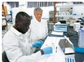
Researchers study infectious diseases at Ghana-TMDU Research Collaboration Center.