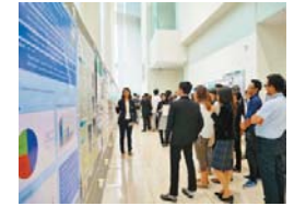
Participants in the International Summer Program learn about medical and dental sciences.