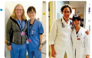
TMDU's medical students experience clinical training at Harvard Medical School's affiliated hospital in Boston, Massachusetts.