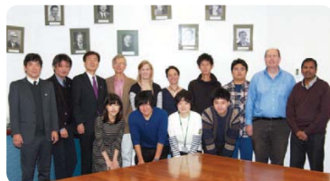
International students participate in exchange program with Australian National University.