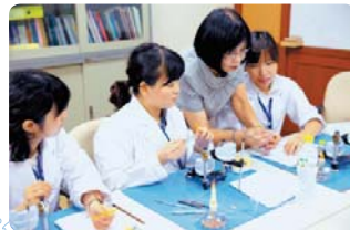
Students participate in an exchange program at Imperial College London, UK.