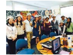
Students celebrate Children's Day holiday in the Japanese way.