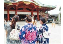
Students visit a shrine in Tokyo for Tanabata, the star festival in July.