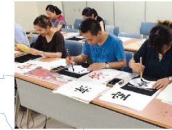
International students take Japanese calligraphy lesson.