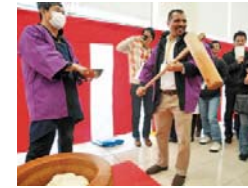
International researchers celebrate the new year with "Mochi-Tsuki" (rice pounding), a Japanese custom.