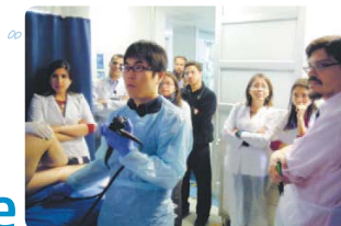
In Chile, where TMDU's Latin American Collaborative Research Center is located, doctors of TMDU and Clínica Las Condes work on a project to prevent neoplasia of the colon and rectum.