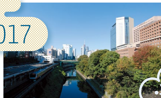
Present-day Ochanomizu, showing the same view as in the above woodblock. Ochanomizu Station is at the left and the TMDU Main Campus is at the right, with the Kanda River flowing between them.