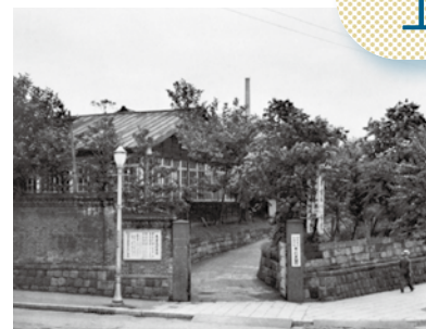
The Tokyo National School of Dentistry, the predecessor of TMDU, was established at Hitotsubashi.

Today, TMDU is still located in Ochanomizu / Yushima district where its predecessor, the Tokyo National School of Dentistry, had moved in 1930, two years after its founding. TMDU has become known as one of the most excellent research universities in Japan.