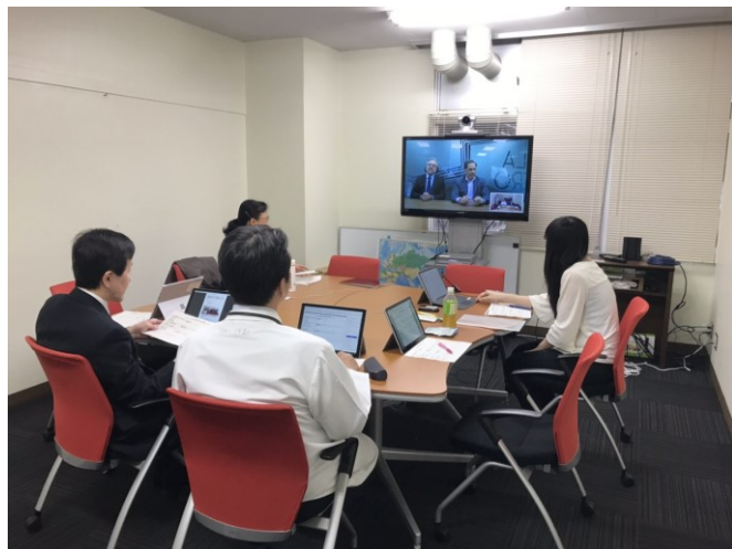
Meeting of JDP medical directors in progress.

On March 28, a meeting of medical directors comprising faculty heads and professors from TMDU and the University of Chile was held via teleconference.