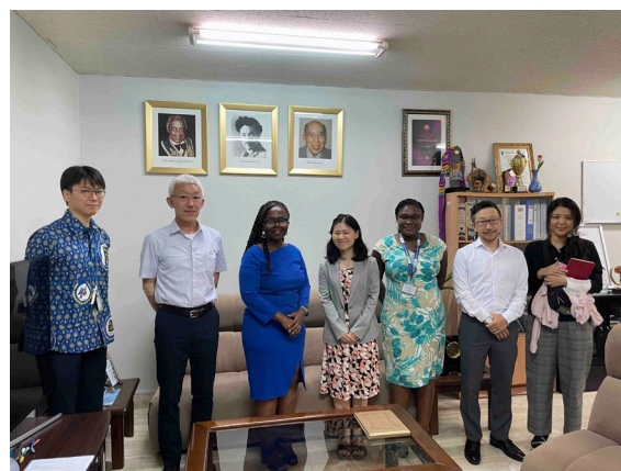
Courtesy visit the director's office of NMIMR