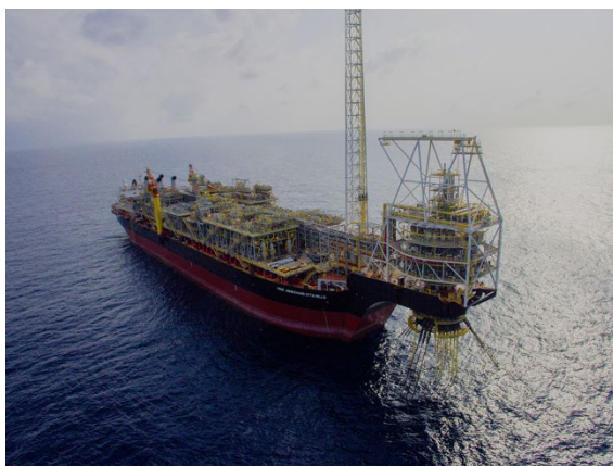
FPSO of MV25 (provided by MODEC)

MV25 supports this project and continues donating to the research of the NMIMR acts as a bridge for medical research between both countries. They believe that supporting medical research in Ghana through the NMIMR further builds alignment between Japan and Ghana. TMDU makes effective use of donations and strongly promotes the countermeasure against local infectious diseases.