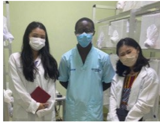
Experiment sceneries in NMIMR