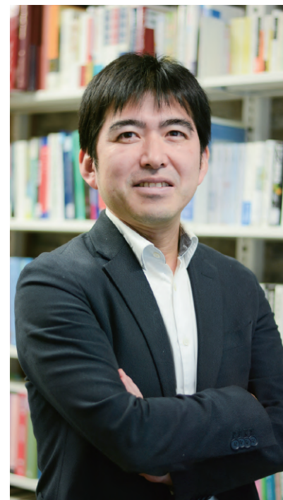
MPH Course Director MD, PhD, MPH Professor

We wish you all the best in the future and we look forward to seeing you again.