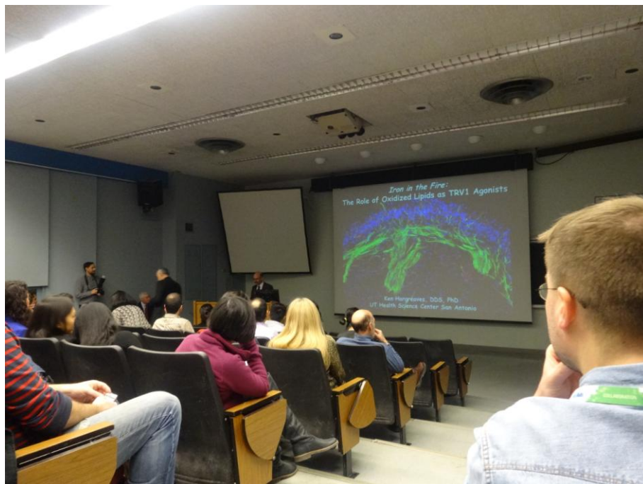
Research Day / The Discussion