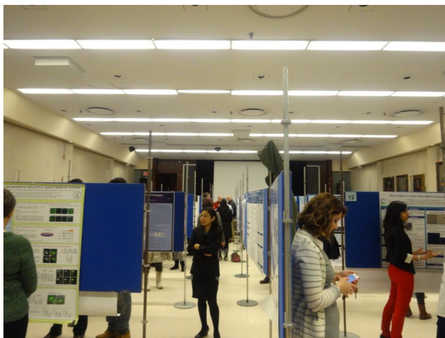
Poster Session Hall