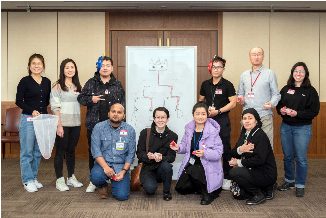
Second place, Team B