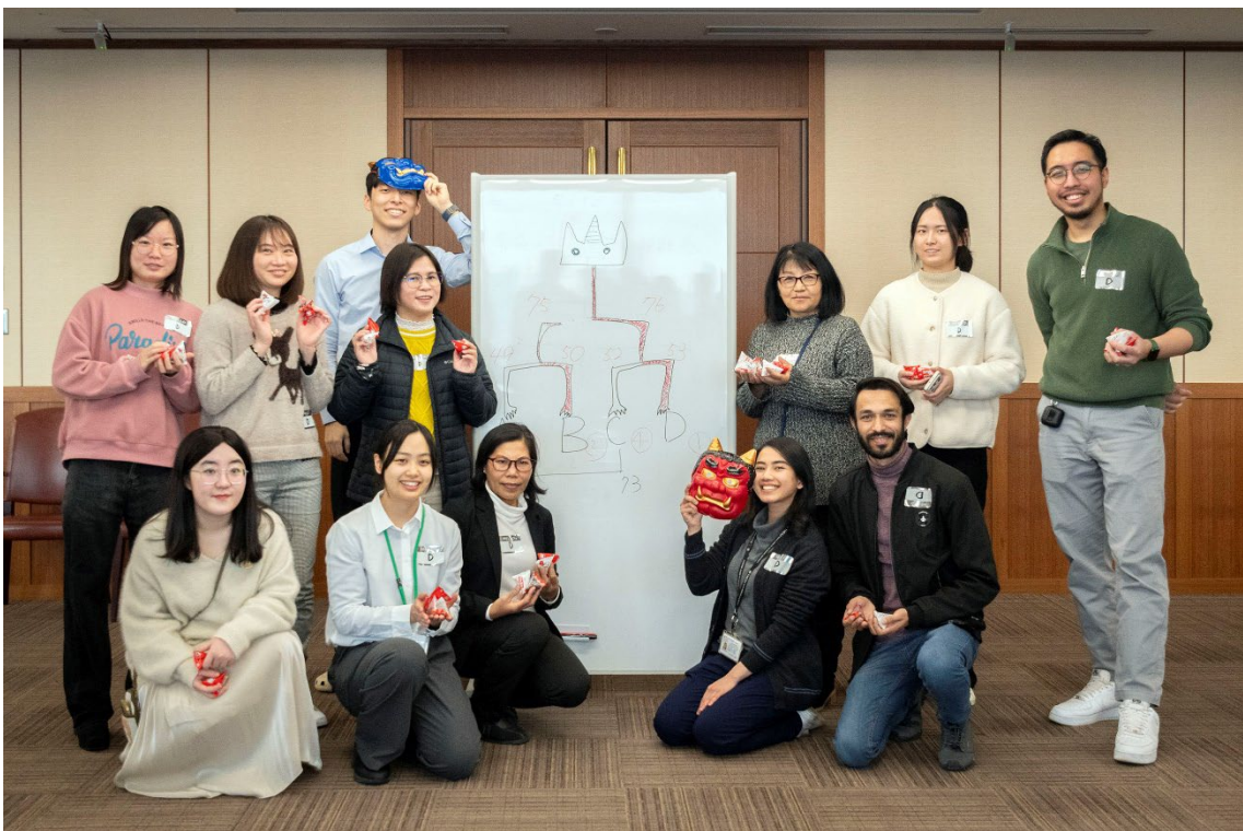
Winner, Team D