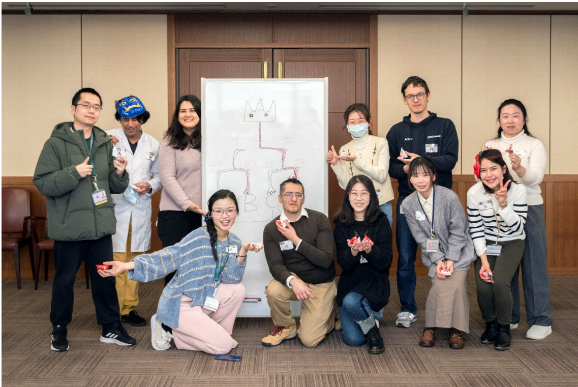
Third place, Team A