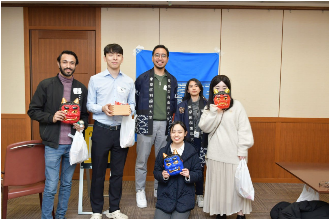
Various photos from Photo Space