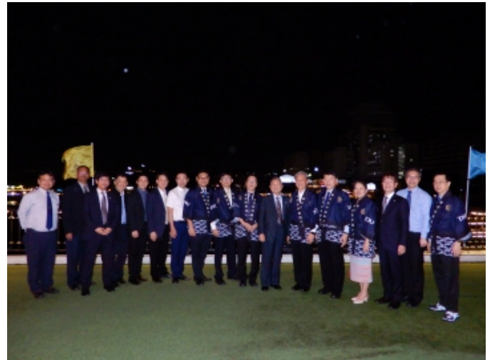
With faculty members concerned of Siriraj after the signing ceremony