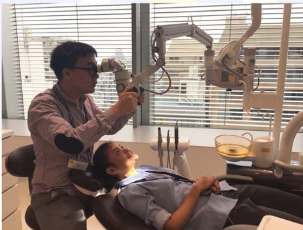
Students trying GC Endodontic Microscope