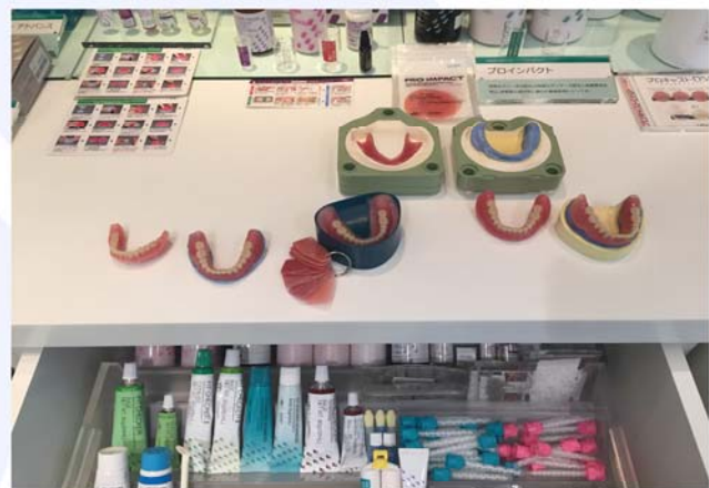
GC prosthesis material