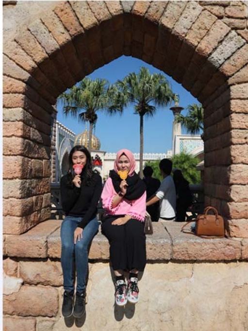
We took pictures for our instagram;)

Chulalongkorn University จุฬาลงกรณ์มหาวิทยาลัย Pillar of the Kingdom