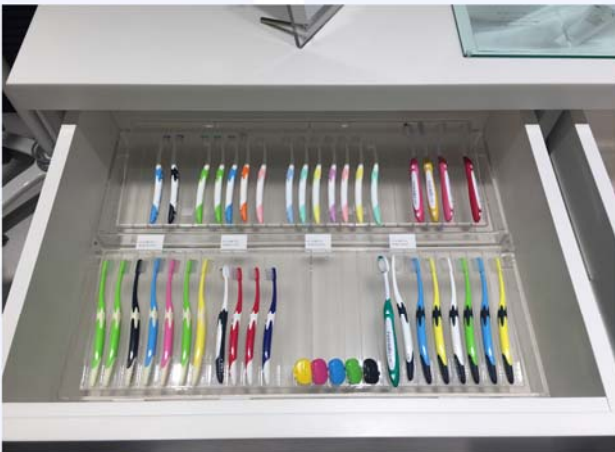
Colorful GC toothbrushes

There are so many GC products that are displayed in the showroom and we were allowed to try each of them and take as many pictures as we like. Truly, it was an eye-opening experience because GC company is beyond what we are thinking of before. Before the visit, we thought that GC is only a manufacturer of impression materials and restorative materials as we used to use those products in Indonesia. But then, it turned out that GC company also produce laboratory products, preventive materials, child dental care products, and even dental chairs and large laboratory equipments.