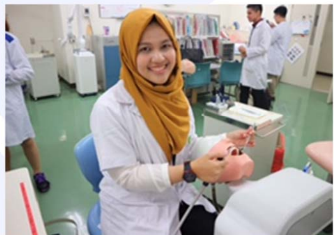
Student trying the 3D simulation machine in the skills lab room