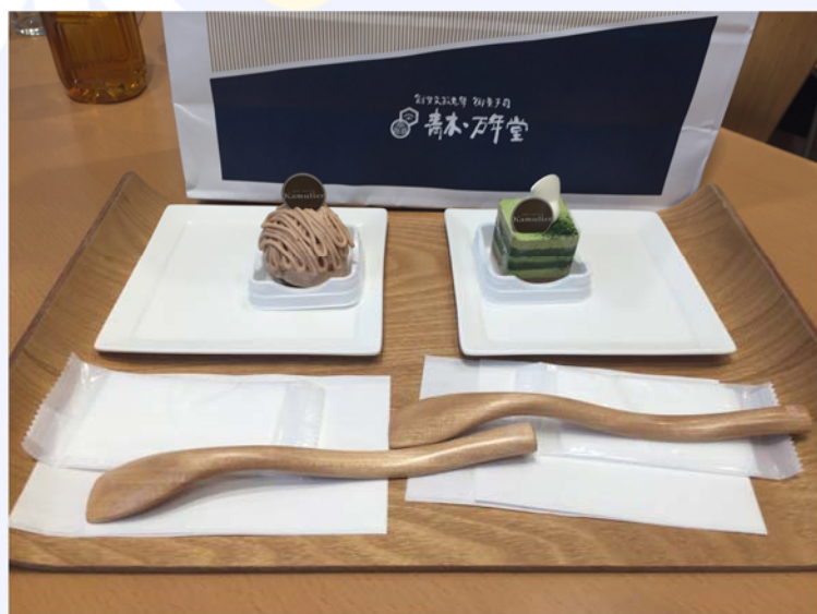
Cakes in Kamulier Cafe

At the end of the visit, we walked in a newly built café next to the building, called as Kamulier, which is owned by GC company too. It specializes in cooking healthy food for geriatric people. So the food can be chewed and swallowed easily and it is not added with chemical preservatives and relatively low in sugar.