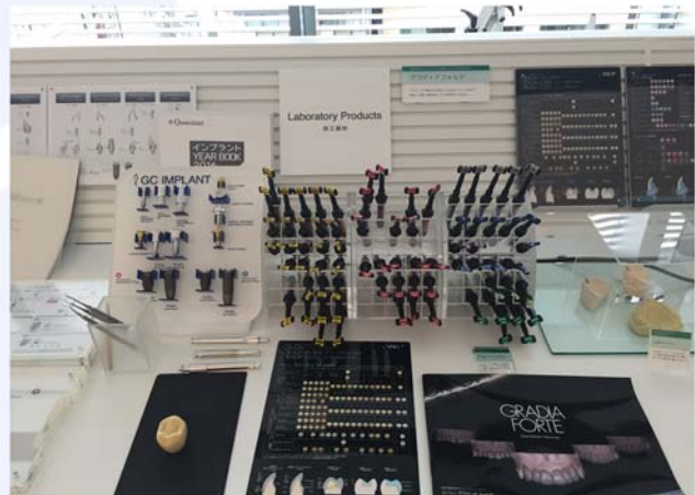
GC Laboratory Products