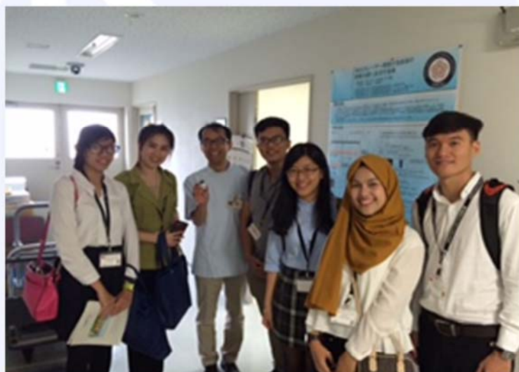
Students with the professor of periodontics department of TMDU

In the morning, we were gathered at 9 am to be divided by the clinical lab that we had to visit and the students and staffs from TMDU was guided us to our destination. Each of us visited 2 different clinical labs, from 9.30 until 11.30 and from 13.00 until 15.00 after we had lunch. Some of us visited periodontics department of TMDU on the first clinical lab visit. At department periodontics, we were explained about the periodontics clinical cases that the professors had been worked on. The professor also explained about bone regeneration techniques that are used in TMDU dental hospital.