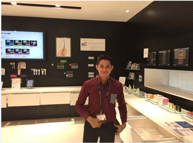
Student Walking Around the Gallery

Chulalongkorn University จุฬาลงกรณ์มหาวิทยาลัย Pillar of the Kingdom