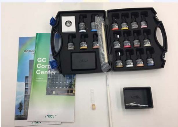
GC Shading tints for restoration kit

In the afternoon, we also got a chance to visit GC company Headquarters. GC company is one of the leading dental manufacturers in the world. It is well known for producing high quality products for dentists. There, we were allowed to try a sample product of GC shading tints for creating dentogenic restorations. It is essential for aesthetic dentistry.