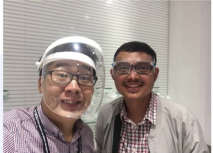
Students Trying GC Protective Mask

At the end of the visit, we walked in a newly built café next to the building, called as Kamulier, which is owned by GC company too. It specializes in cooking healthy food for geriatric people. So the food can be chewed and swallowed easily and it is not added with chemical preservatives and relatively low in sugar.