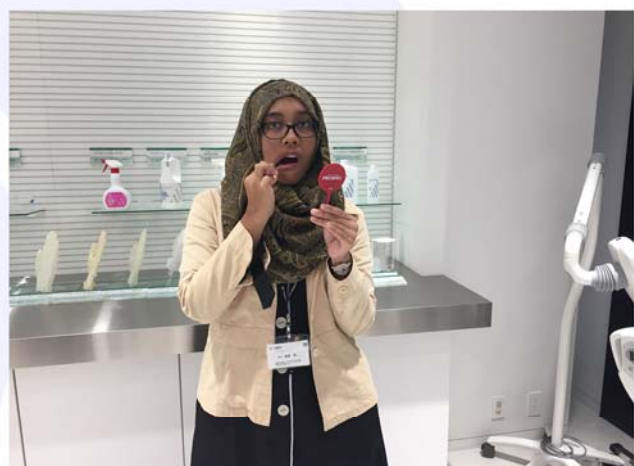
Student applying the GC Rusticello CPP-ACP